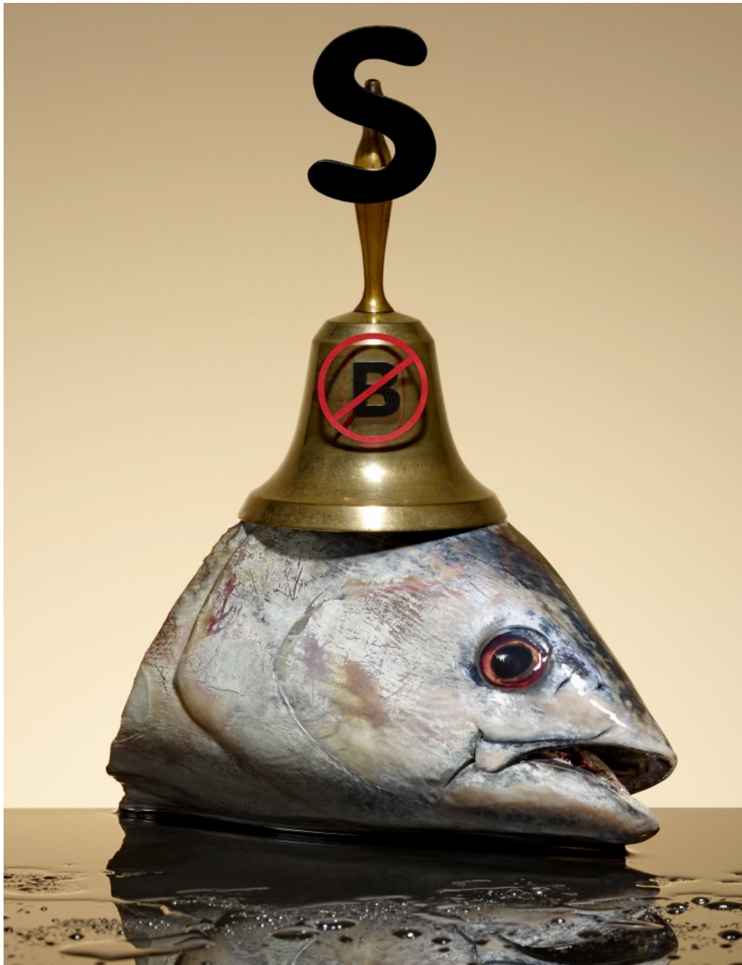
Bela Borsodi, Selfish , 2018.

For this one I wanted the whole composition to look very brutal, very full — the fish looks like a bag of money. First I was trying to find bells in a particular size, but that ended up being easy compared to finding the fish. I thought a severed fish head was more brutal than a full fish, so I was trying to find a fish head in Chinatown. I fell in love with Bonito, a giant fish — they must be three feet long. I totally underestimated how heavy it would be to carry this fish home, and then I had it in the kitchen and realized I had to