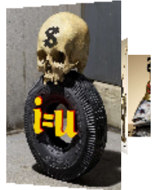
Bela Borsodi, Bubblegum , 2018.