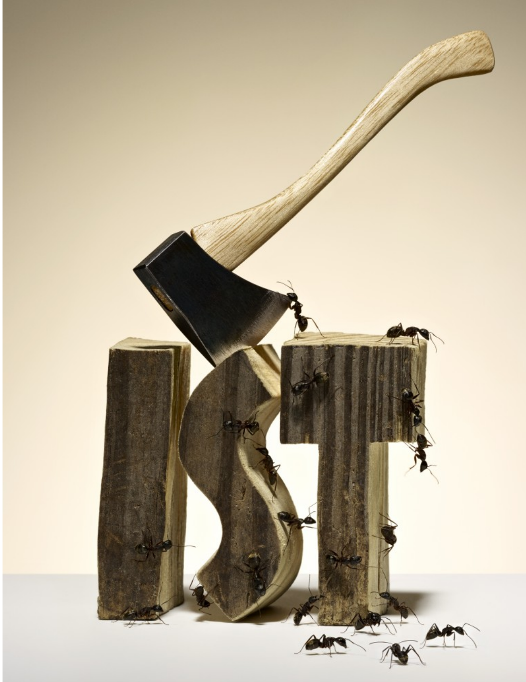
Bela Borsodi, Existence , 2018.

gun in this case. Someone came up to me and actually asked me, “What you have in your little case?” I answered, “just a gun.” Then when I got to my studio with the gun, I had to get the bubbles. I blew about 200,000 bubbles hoping one would make for a good picture.